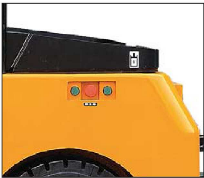
Forward/Reverse inching switch and emergency switch are mounted on the left rear, them make the hook easy and safe.