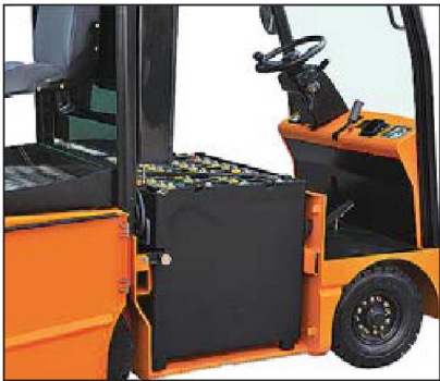
Side-exchange battery design is convenient for changing battery.