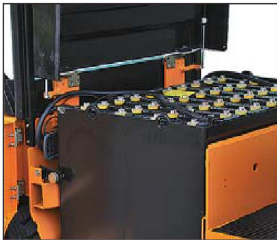
The battery cover can be fully opened , the design is easy for maintenance.